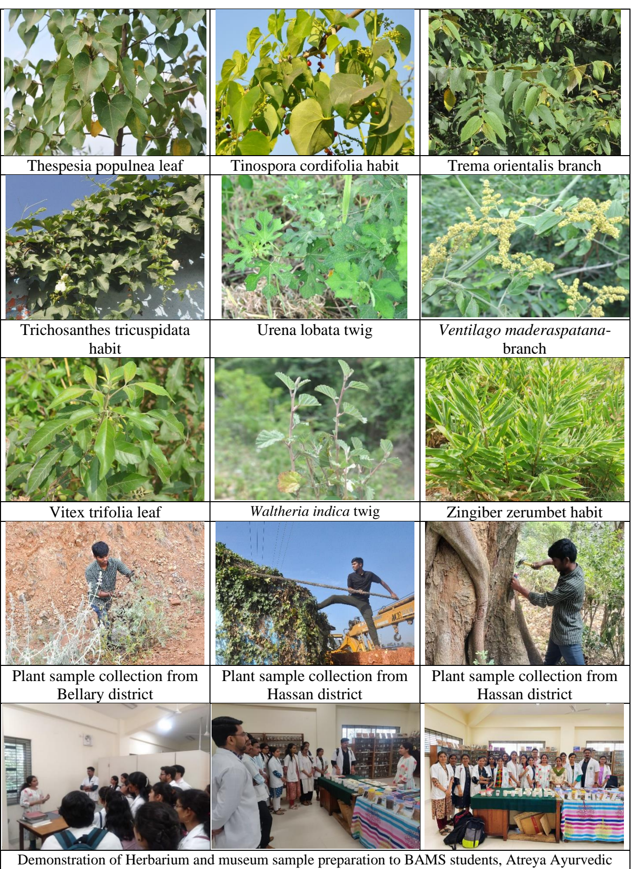
Medical College, Hospital & Research Centre, Bengaluru