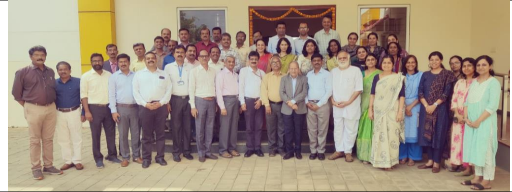
During two days (5<sup>th</sup> -6<sup>th</sup> October 2023) workshop on "Geriatrics:Integrative approach and challenges"