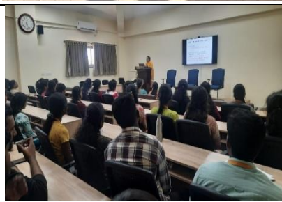
Demonstration of Herbarium and museum sample preparation to B.Pharm students, East West Point College of Pharmacy, Bangalore