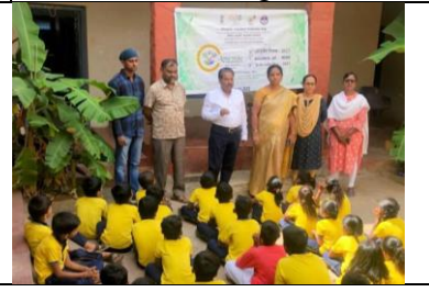
Celebrations of Ayurveda Day 2023 at Govt. School, Thulasithota, Bengaluru