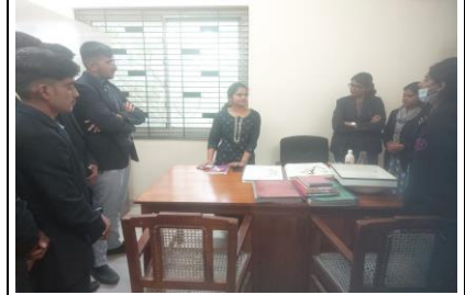
Demonstration of Herbarium and museum sample preparation to B.Pharm students, T.John college of Pharmacy, Bengaluru