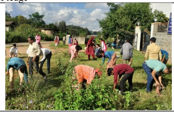
Oraganizing Swachta program 2023 at CARI Bengaluru