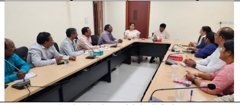
During institute visit by DG sir.