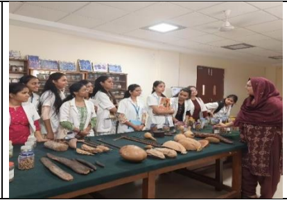
Demonstration of Herbarium, museum sample preparation and herbal garden to 2<sup>nd</sup> year BAMS Students of Sri Sri College of Ayurveda, Bangalore