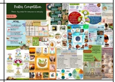
Poster competition on the occasion of Ayurveda Day at CARI Bengaluru.