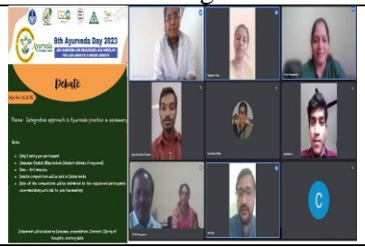
Debate competition on the occasion of Ayurveda Day at CARI Bengaluru.