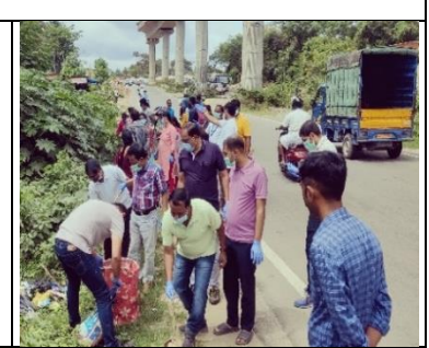
Swachta hi Seva Campaign 2023