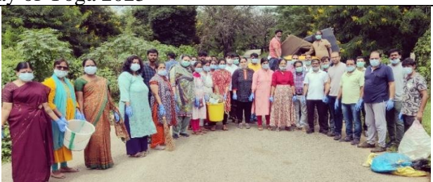
Swachta hi Seva Campaign 2023