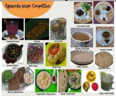
Ayurveda Recipe competition on the occasion of Ayurveda Day at CARI Bengaluru.