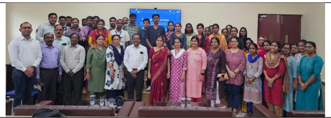
दिनांक 26 मार्च 2024 को संस्थान में आयोजित राजभाषा हिंदी कार्यशाला के दौरान संस्थान प्रभारी, सभी अधिकारी, संस्थान के कार्मिक अतिथि वक्ता के साथ।