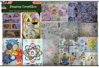
Drawing competition on the occasion of Ayurveda Day at CARI Bengaluru.