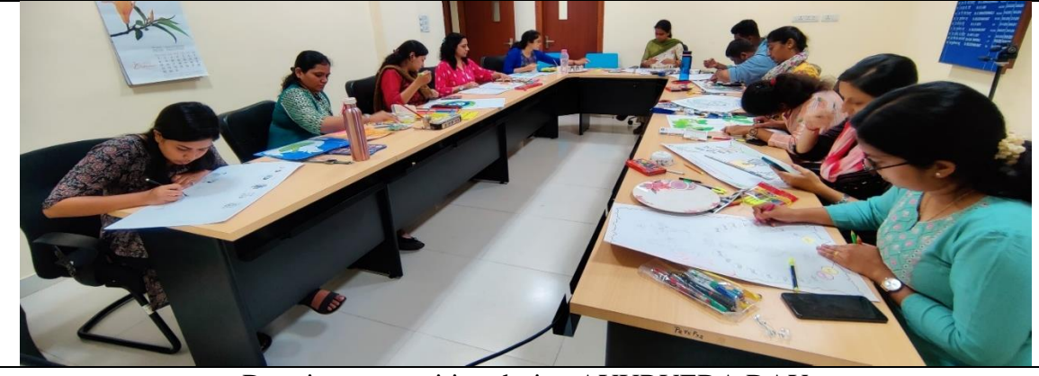
Drawing competition during AYURVEDA DAY