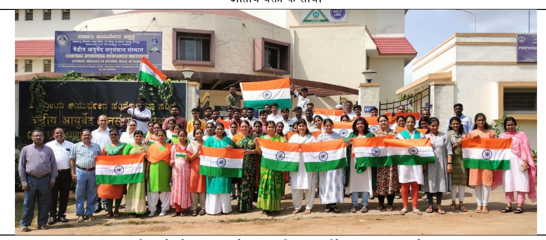
स्वतंत्रता दिवस के दौरान संस्थान के सभी अधिकारी कार्मिक, संस्थान प्रभारी के साथ।